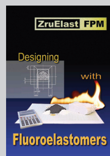
Brochure „Designing with Fluoroelastomers“

More information can be found at www.fkm-rubber.com – download.