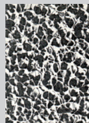
Fig.1: Predominantly open-cellular material