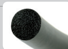
Cord ZruMoos® FPM