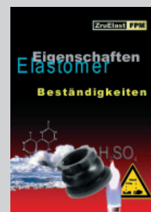
Chemical resistance guide with over 1,700 chemicals