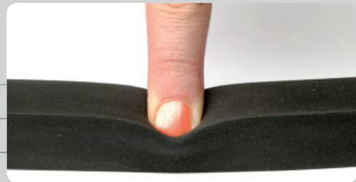
light deformability of sponge rubber ZruMoos® FPM